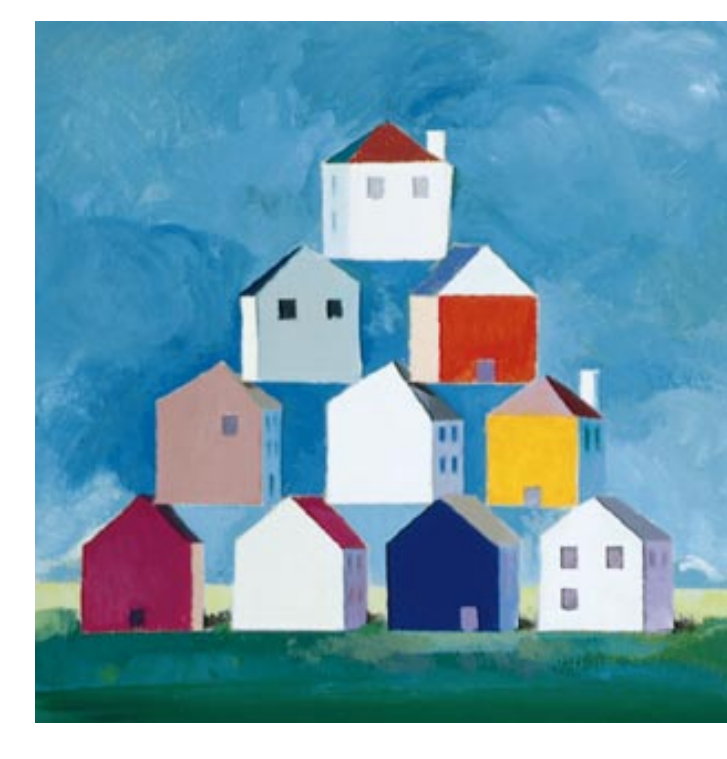
A guide for home buyers